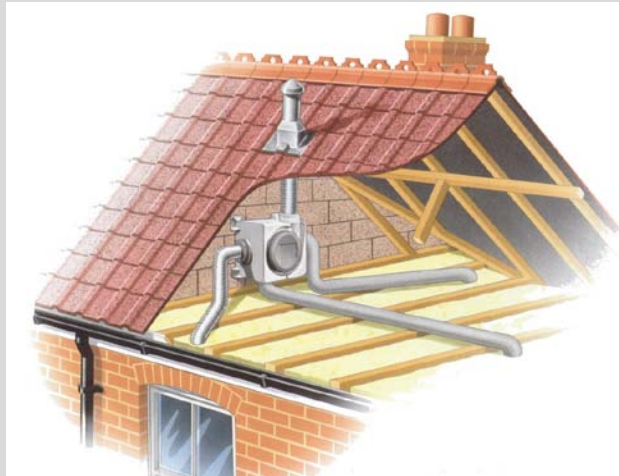
Figure 2 Sample Mounting Position